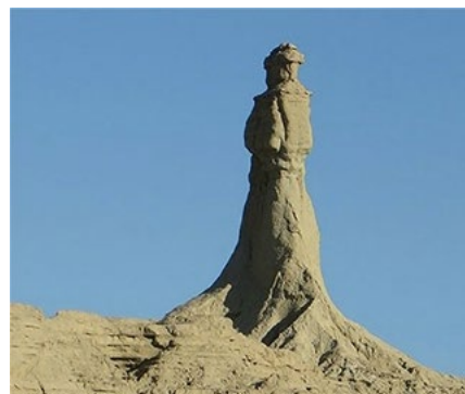
740 years old Princess of Hope near Ormara, Balochistan