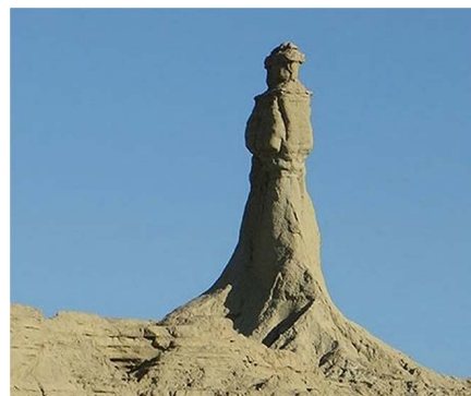
740 years old Princess of Hope near Ormara, Balochistan

so that all the grievances could be resolved in a timely and prompt manner. The Vice Chancellor also presented Annual Report 2019 to the Honorable Chancellor on this occasion.