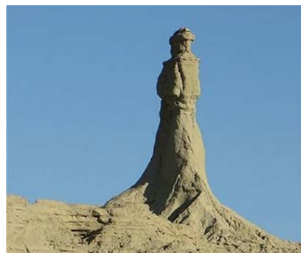
740 years old Princess of Hope near Ormara, Balochistan