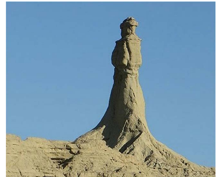
740 years old Princess of Hope near Ormara, Balochistan