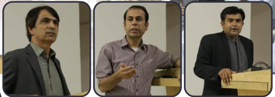
The Directorate of Student Affairs at the (UoT) organized a week-long orientation and counseling program for newly enrolled undergraduate students of the 2025 session.